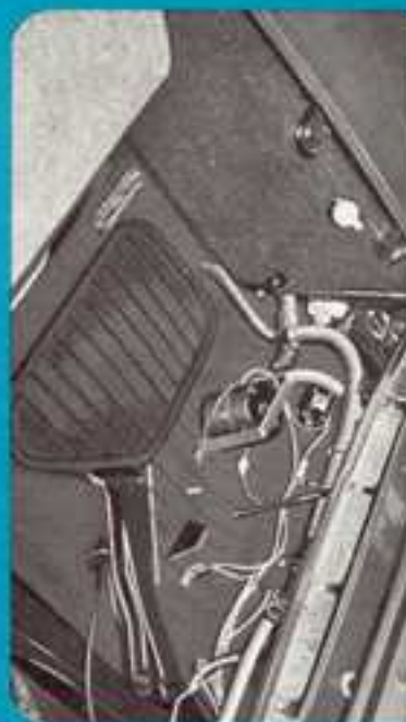
Compact blower and evaporator unit is hidden below floor of trunk compartment, takes up no usable luggage space.

The PorscheAir custom air conditioner has been engineered to complement the fine craftsmanship of the Porsche itself. All its components are of the highest quality and have been rigorously tested to insure excellent performance with minimum maintenance.